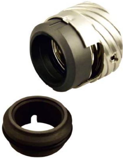
Pumping direction of the screw look at page 121

Universal norm seal for high pressure applications with pumping screw Stepped shaft/shaft sleeve Massive replaceable seal rings Super-sinus-spring Multiple springs